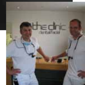
Client: The Clinic Dental Facial Location: Haywards Heath