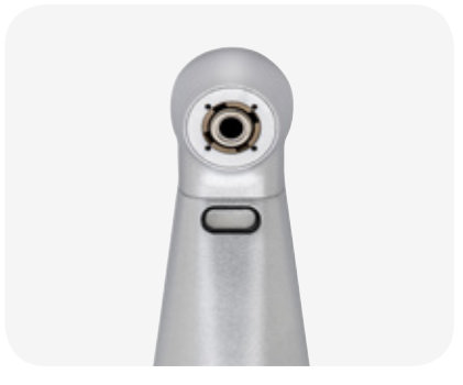
Optimal cooling from four sides Continuous cooling with Quattro Spray.