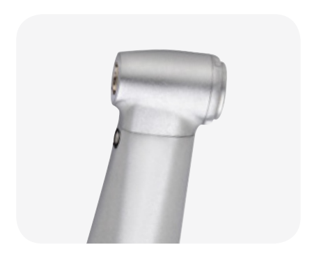
Small head Best visibility and optimal access thanks to new small head sizes.