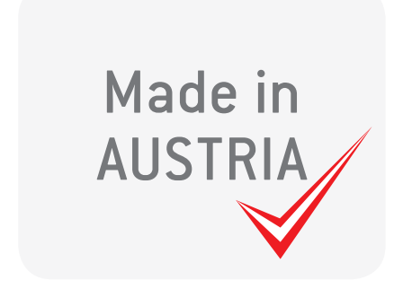
Reliability Top quality for a long life.