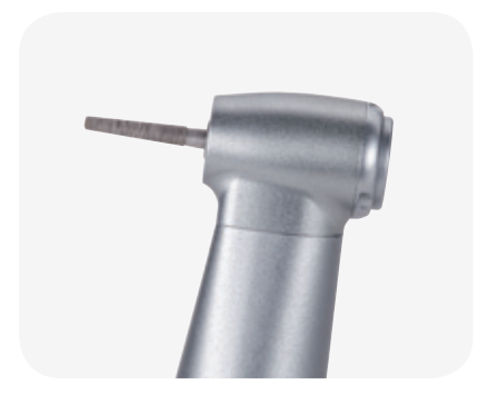
Quiet Noticeably quieter – thanks to new gearing technology.

People have Priority: To make it easier to select one of our new Synea straight and contra-angle handpieces, we listened to your requirements and have now developed two new lines perfectly suited to your needs. Synea Vision: now with innovations such as special scratch-resistant coating. and Synea Fusion: a series with top quality and maximum economy.