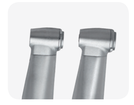
Customised production Different head sizes for optimal access options.