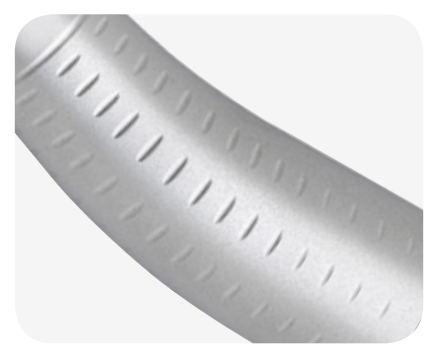
Optimised grip profile for secure grip and optimum hygiene.