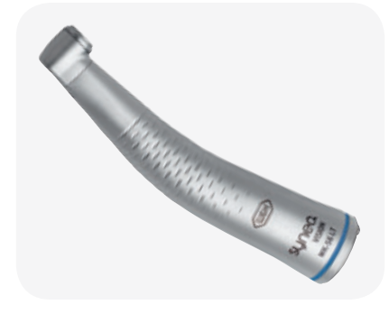
Monoblock design ergonomics cast from a single piece – for optimal hygiene.