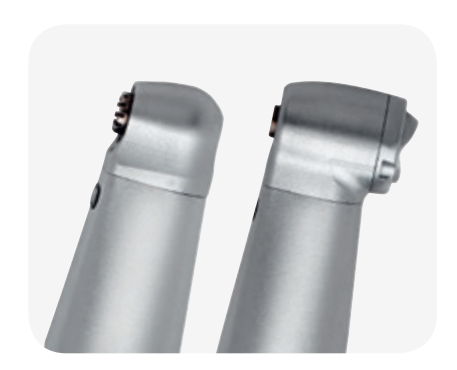
Special instruments Special reciprocating contra-angle handpieces for areas that are difficult to access.