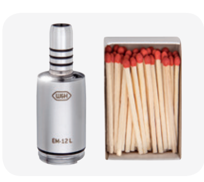
Small but what power

Fit perfectly in your hand: the contra-angle handpieces of the Short Edition.