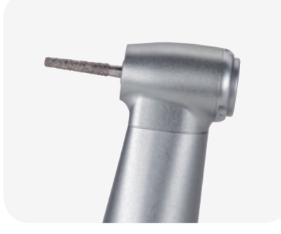
Excellent preparation results

The 5x spray ensures even cooling of the treatment site under all conditions.