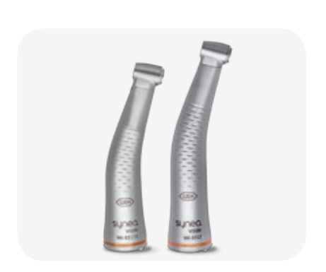
Synea Vision Short Edition The short route to better ergonomics.