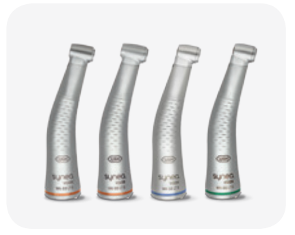
Contra-angle handpieces for all situations

The new micromotor EM-12 L with LED for bright as daylight illumination of the treatment area.