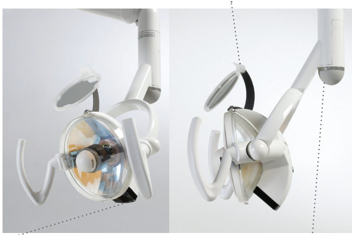
Retractable Patient mirror

ON/OFF Touchless sensor and soft-push button (with light intensity indicator) for Composite Curing Safe Mode and two light intensity settings: Low – 18,000 Lux and High – 28,000 Lux. 4200 Kelvin