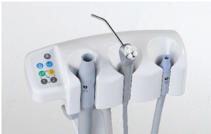
Assistant's console with chair, cuspidor and light 2 controls