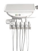
CLESTA II-M 4 Air or Electric 5 versions