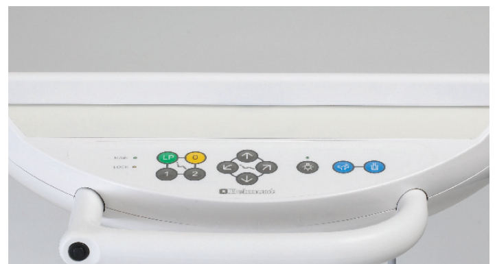
'A' version control panel includes chair and spittoon controls

Control all chair movements by hand or foot: by hand from both the Operator's and Assistant's console; by foot using the foot control. Spittoon functions and ON/OFF light control 1 are also activated from both the Operator's and Assistant's console.