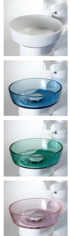
Spittoon bowl options: blue/green/pink glass (porcelain as standard)