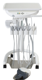
CLESTA II-MC 4 Air or Electric 5 versions