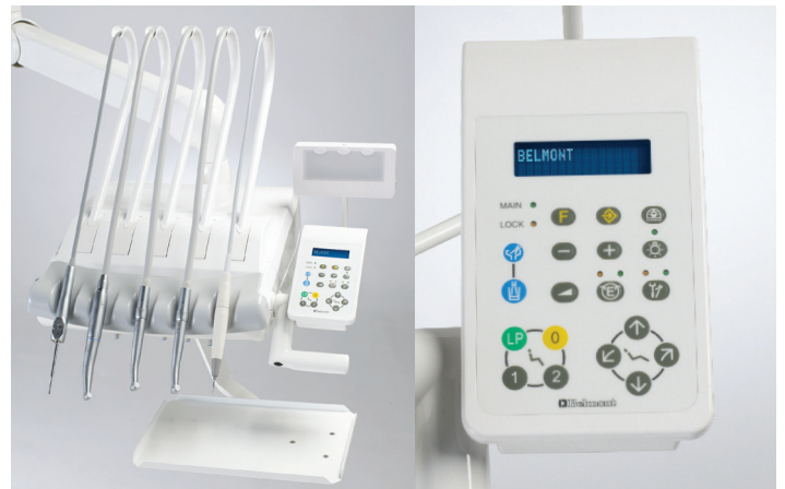
Continental Rod type Operator's console ('E' version)