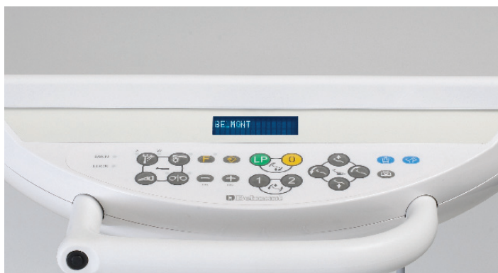
'E' version control panel includes instrument, chair, spittoon and light controls